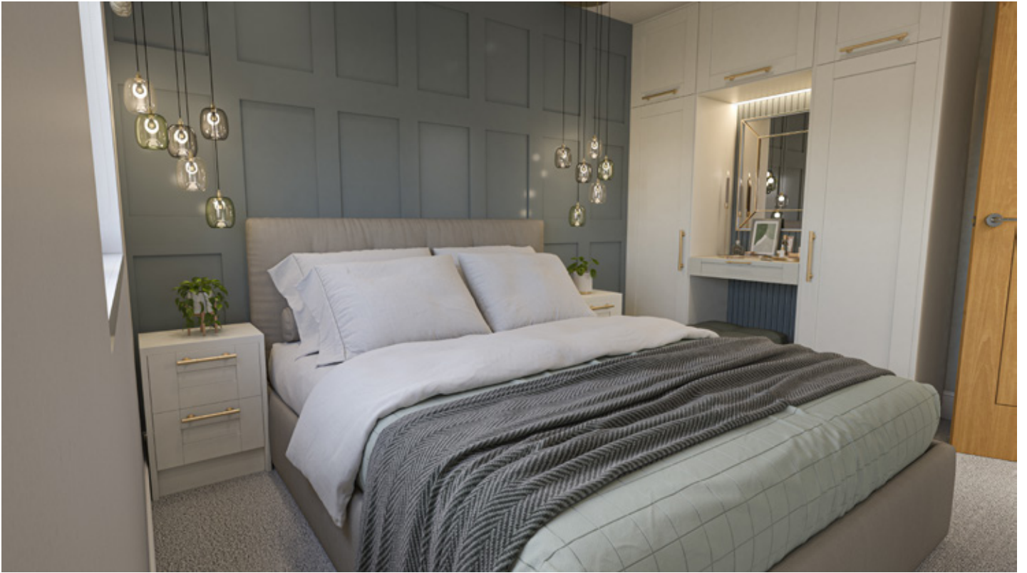
Bedroom 2 Option