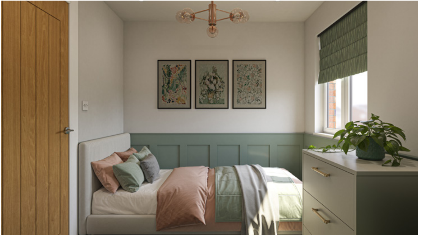
Bedroom 3 Option